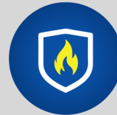
Fire Control System